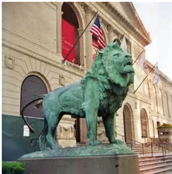
(Chicago Art Institute, photo by Kim Scarborough, 2006)