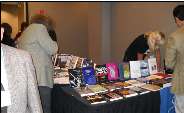
The Book Exhibit . . .