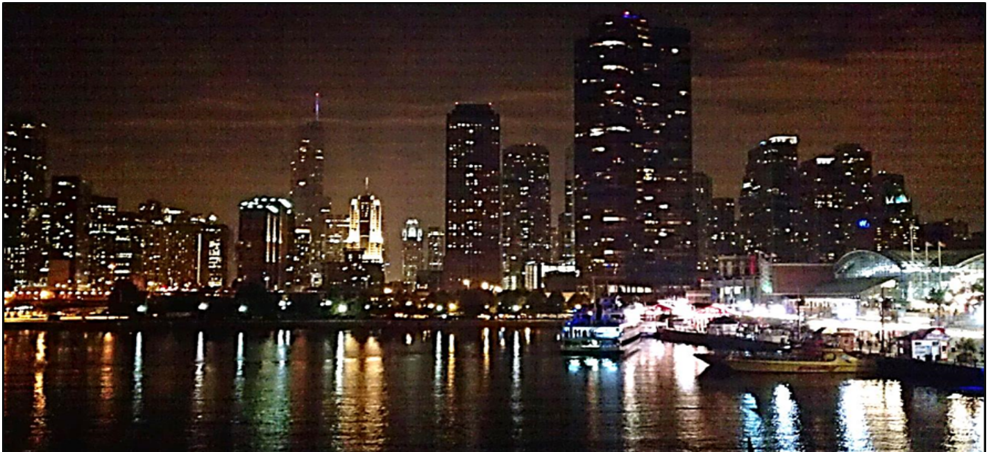
Chicago Skyline as seen from the cruise ship excursion.

Thanks to Tania Smith (Canada) and Rob Gilmor (USA) for sharing their photographs from the Chicago Conference.