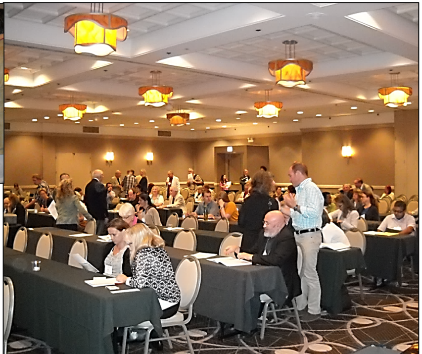
Gathering for a plenary . . .