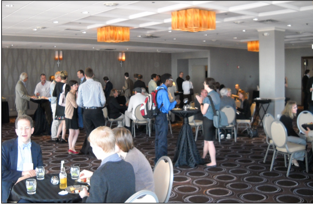
The Welcome Reception . . .