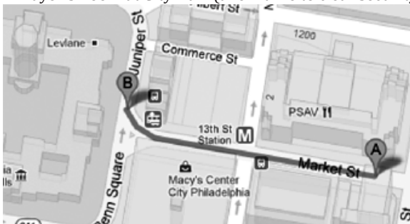
(Broad and Market Streets)

OFF-SITE VENUE: Mayor's Room at City Hall (allow time to clear security)